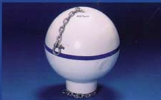
18" Mooring Buoy with External Ballast