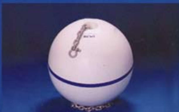
24" Mooring Buoy