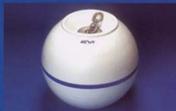
32" Mooring Buoy w/Shackle Pocket