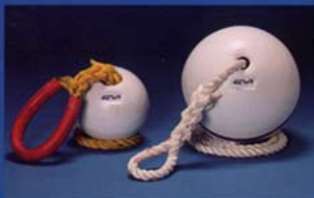
12" & 18" Mooring Buoy