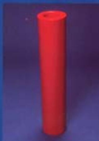
Underwater Buoy Supports 19lbs.